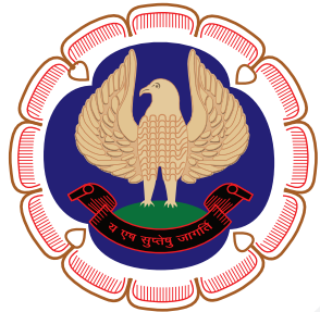
The Institute of Chartered Accountants of India (Set up by an Act of Parliament)